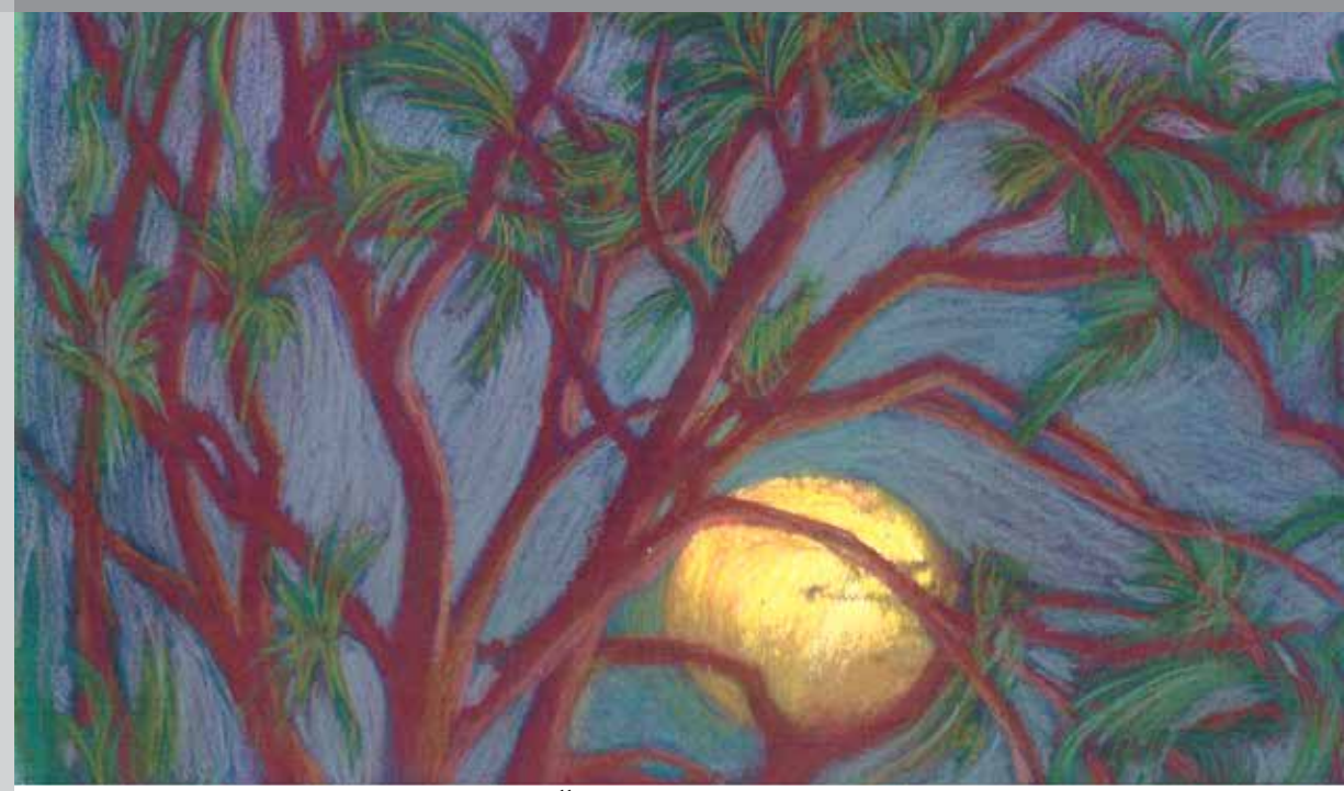
"My barn having burnt to the ground, I can now see the moon." — Mizuta Masahide (17th century Japanese poet and samurai)

International Association of Buddhist Women